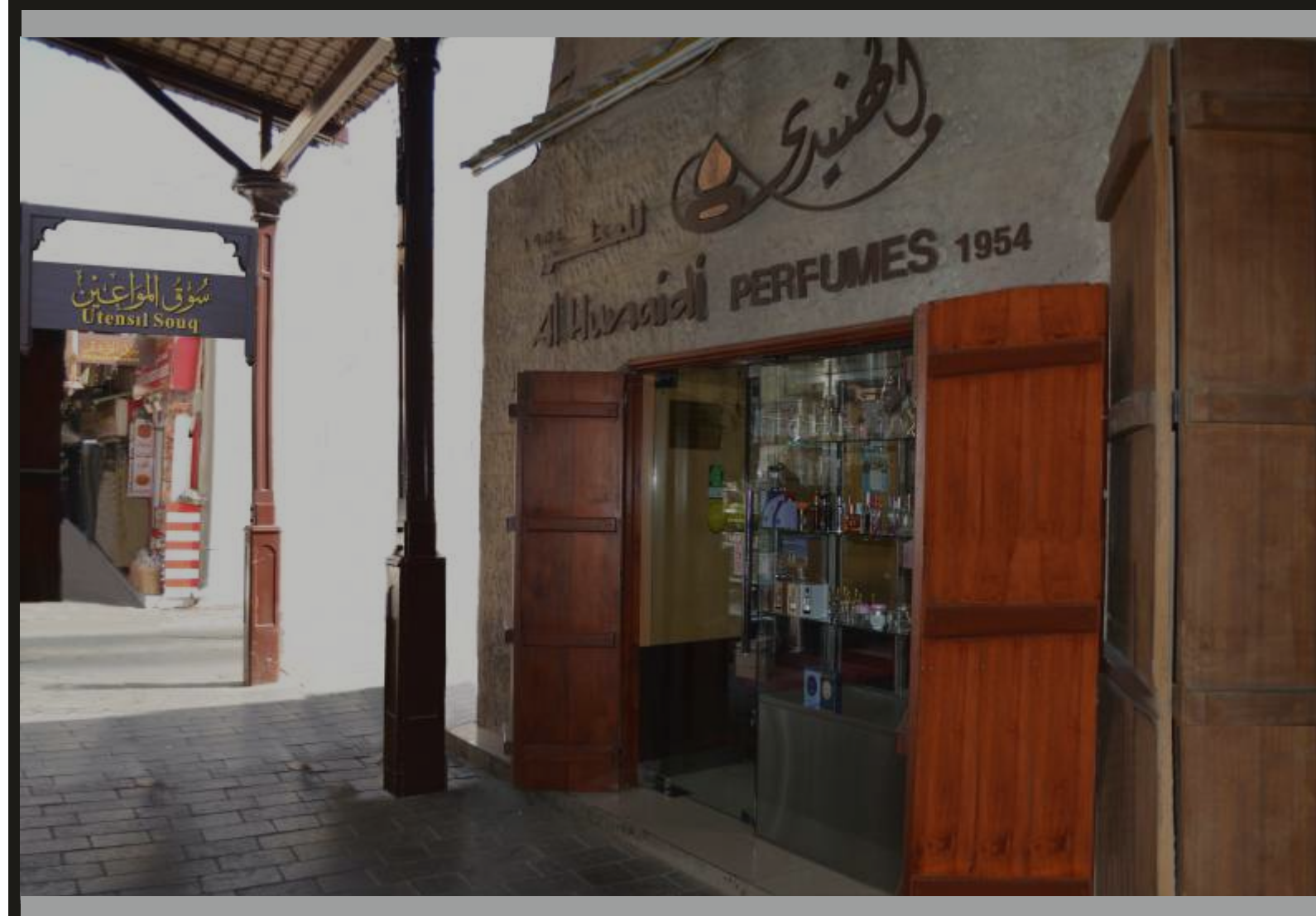
The first Al Hunaidi perfume shop in Dubai